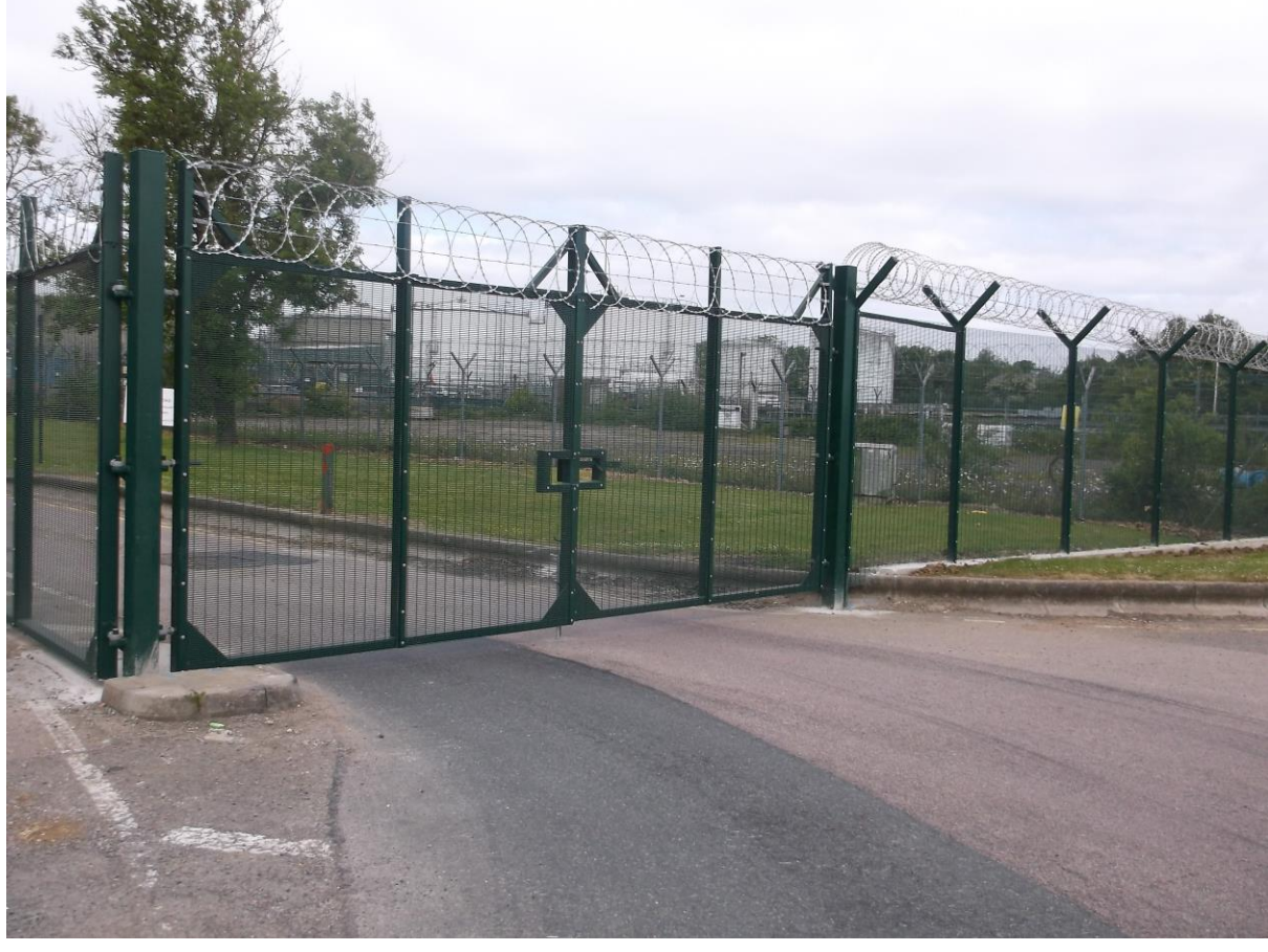
Page - 3 -