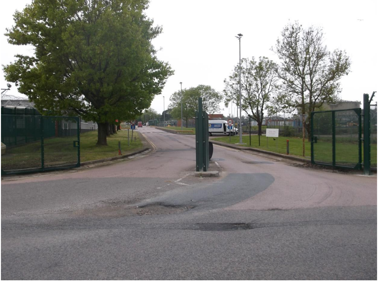
Page - 2 -